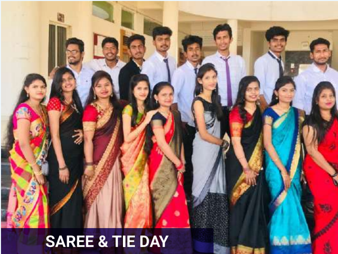
SAREE & TIE DAY