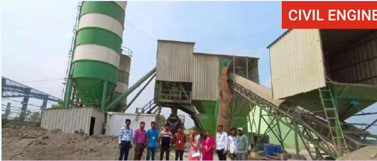
Industrial Visit to Ready-mix Concrete Plant, Moshi.