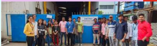
Industrial Visit to ZINCPRO SV GROUP, Chakan on 9 th May 2022 to understand the working of CED coating.