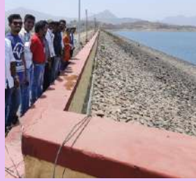
Industrial Visit to Pawna Dam to study Dams & Hydraulic structure.